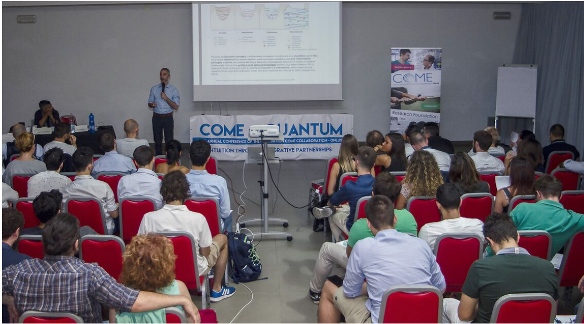
A session of the QUANTUM Conference - Italy – Florence 2017

The COME Collaboration's Annual meeting is an innovative, must-see and be-seen event for professionals who want to keep abreast of latest research, new technologies and fresh ideas. The meeting boasts a combination of exciting scientific programs, practical workshops and social events, all tailored to the city the meeting is being held. Membership in the organization is growing and the meeting continues to be an experience of excellence for the high quality of the Conference Topics and Contents.