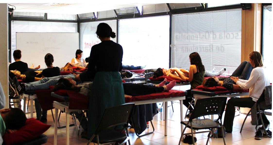
Clinical treatment session during QUANTUM Global – Barcelona 2017

Website: http://www.comecollaboration.org/come-to-quantum/2017-2/