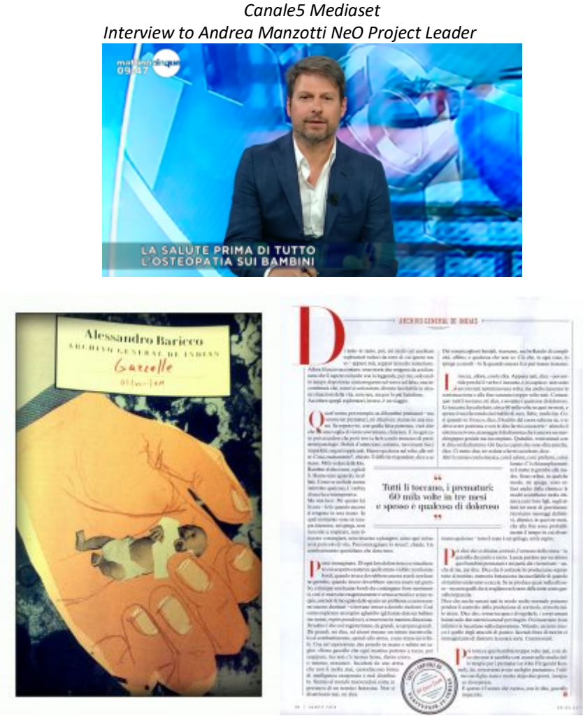
Alessandro Baricco (writer) – Vanity Fair Italy

Very good feedbacks came from the public who follow our projects and us. The NeO project has a great media impact and success. Italian medical magazines and TV broadcasts focus on health and wellbeing talked about COME Collaboration and the NeO Projects.