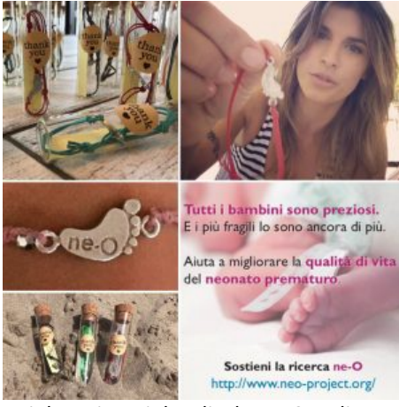
Special Testimonial – Elisabetta Canalis – Italy